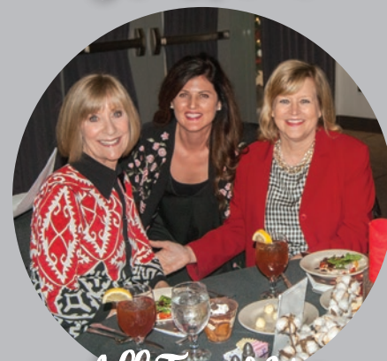
All Fixed Up