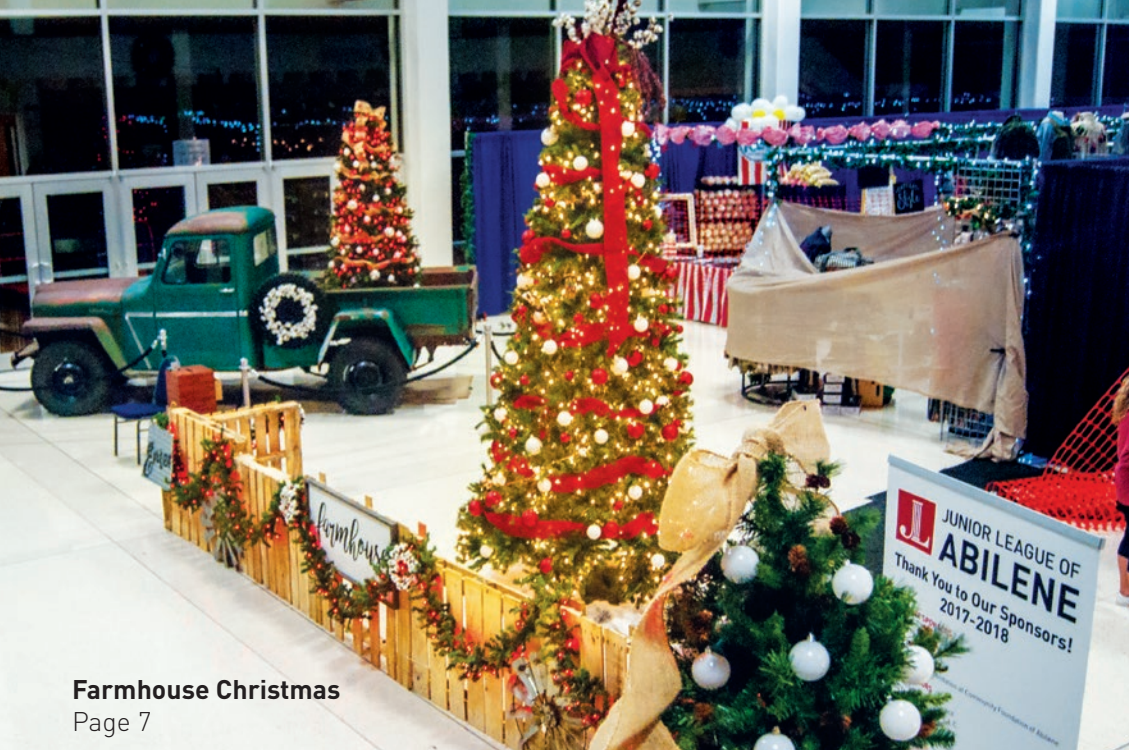
Farmhouse Christmas Page 7